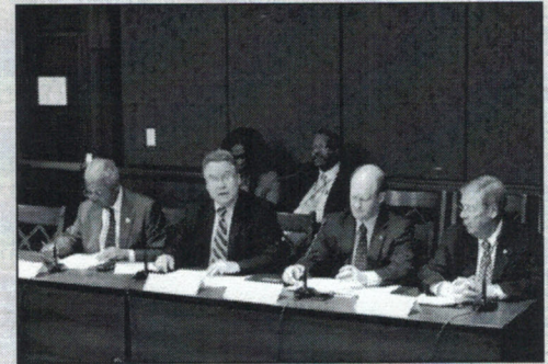
From left to right: Congressman Donald Payne, Chairman Christopher Smith, Senator Chris Coons and Senator Johnny Isakson

The addressing of these issues was of extreme importance, as it allowed the African Diplomatic Corps to speak with members of Congress on issues that directly affect them and the people of Africa. "Too often, we in Congress have only brief encounters with the African diplomats in Washington," Smith said. "A fuller, ongoing interaction would be of help to both Members of Congress and diplomats in building U.S. - Africa relations that are mutually beneficial." Through exemplary leadership, Congressman Chris Smith and other members of Congress were able to come together with the African Diplomatic Corps to forge a commitment to address the developmental priorities of Africa.